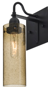
JUNI10PL PLUM BUBBLE