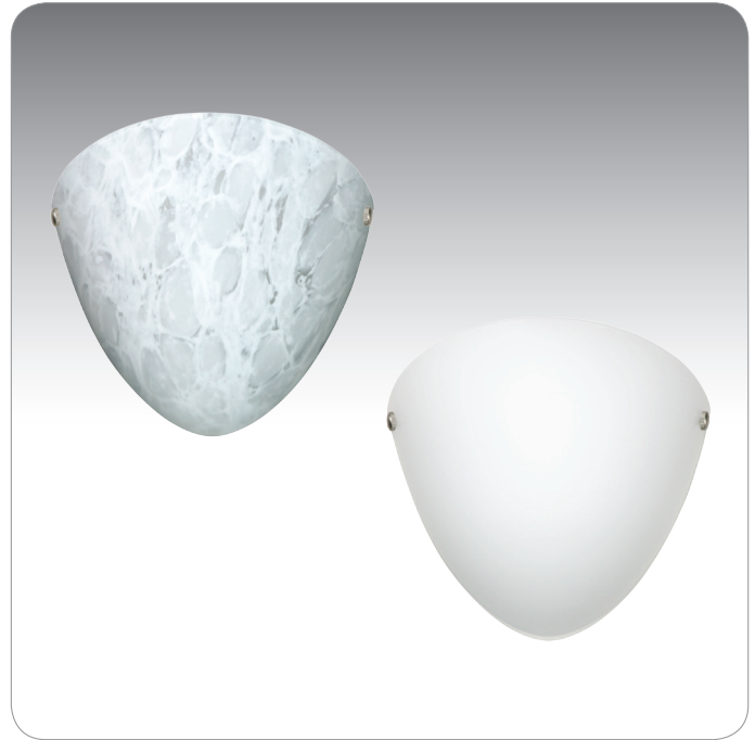
KAILEE SHOWN IN CARRERA (701719) & OPAL MATTE (701707)

UL or ETL Listed. Suitable for Damp Locations (interior use only).