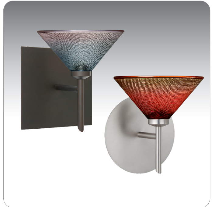
KONA SHOWN IN BICOLOR (117691) WITH SQUARE CANOPY & SUNSET (117681)

UL or ETL Listed. Suitable for Damp Locations (interior use only).