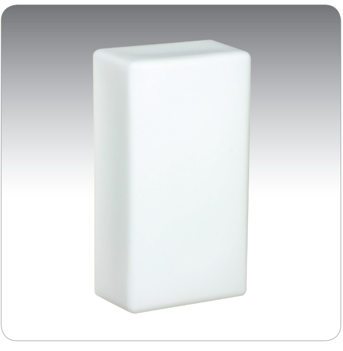
LIDO SHOWN IN OPAL MATTE