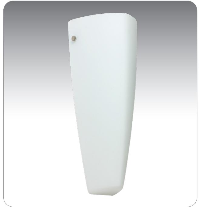
LINA SHOWN IN OPAL MATTE (708307)

UL or ETL Listed. Suitable for Damp Locations (interior use only).