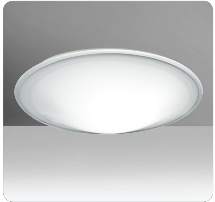
LUMA CEILING SHOWN IN OPAL GLOSSY/CLEAR

UL or ETL Listed. Suitable for Damp Locations (interior use only).