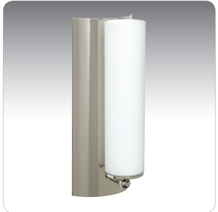
METRO SHOWN IN OPAL MATTE, POLISHED NICKEL (1WE-118607-PN)

UL or ETL Listed. Suitable for Damp Locations (interior use only).