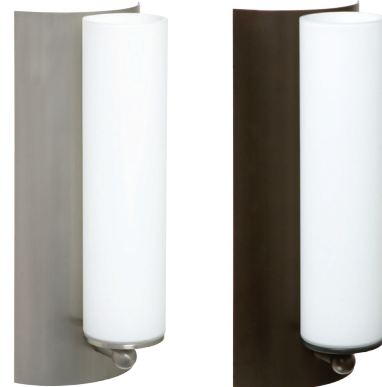
OPAL MATTE, BRONZE

All dimensions provided are nominal. Allowance must be made for dimensional tolerance in handcrafted glasses.