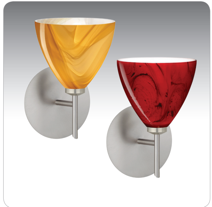
MIA SHOWN IN HONEY (1779HN) & MAGMA (1779MA)