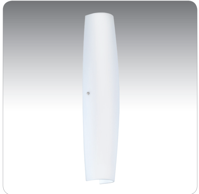
MISTRAL SHOWN IN OPAL MATTE (711207)

UL or ETL Listed. Suitable for Damp Locations (interior use only).