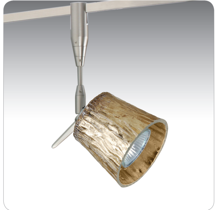
STONE GOLD FOIL SHOWN WITH LED AND ON MONORAIL

UL or ETL Listed. Suitable for Dry Locations (interior use only).