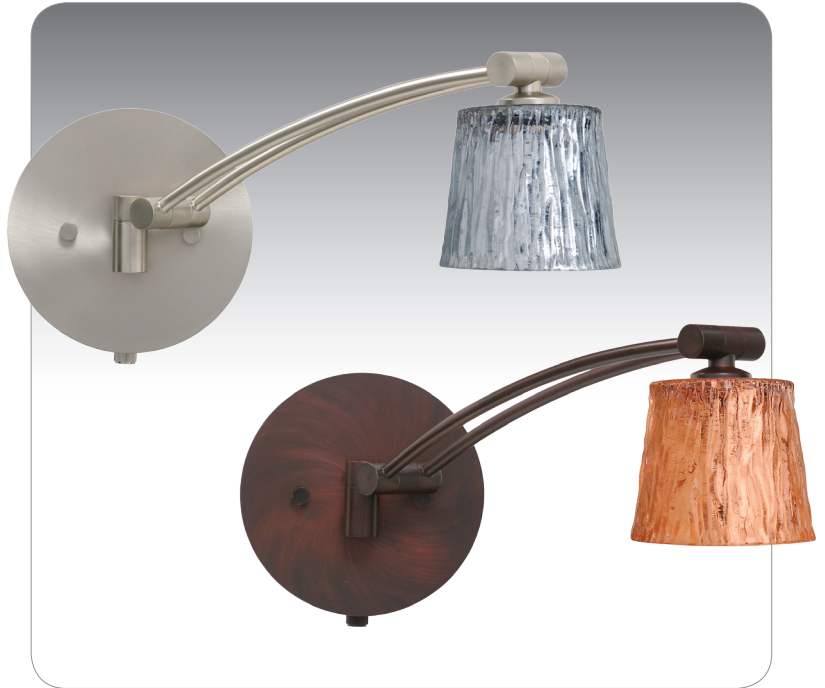
NICO 3 SWING ARM SHOWN IN "WW" STONE SILVER FOIL (1WW-5145SFSN) & "WW" STONE COPPER FOIL (1WW-5145CF-BR) IN BRONZE FINISH

UL or ETL Listed. Suitable for Damp Locations (interior use only).