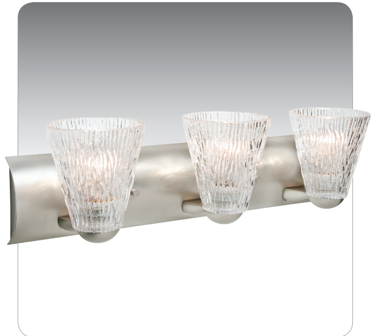
CLEAR STONE (NICO5GL)

UL or ETL Listed. Suitable for Damp Locations (interior use only).