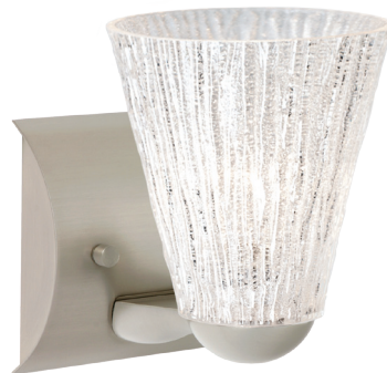
NICO5GL GLITTER STONE