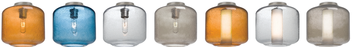
NILES10SO SMOKE BUBBLE/OPAL