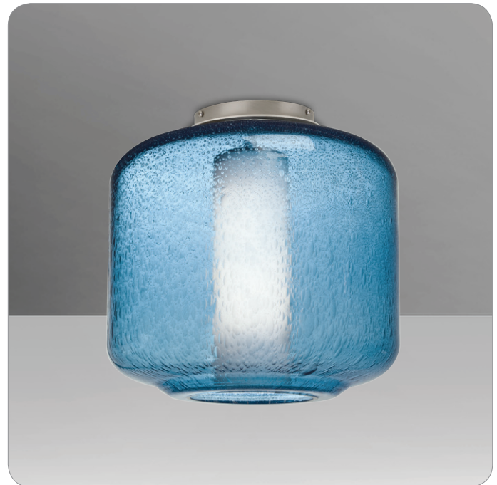
NILES 10 IN BLUE BUBBLE/OPAL (NILES10BOC)

UL or ETL Listed. Suitable for Damp Locations (interior use only).