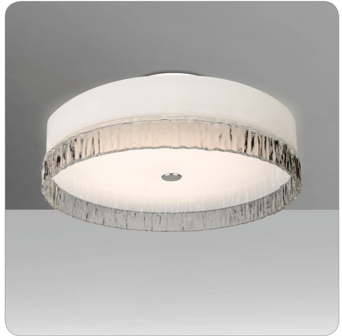
OPAL/SMOKE STONE (PACO19CLC)

UL or ETL Listed. Suitable for Damp Locations (interior use only).