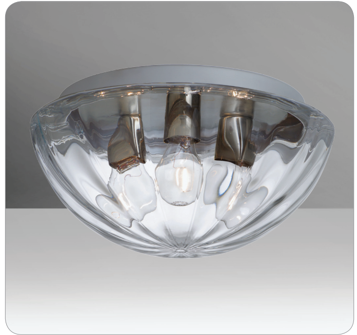
PINTA 15 CEILING SHOWN IN CLEAR (906388C)

UL or ETL Listed. Suitable for Damp Locations (interior use only).