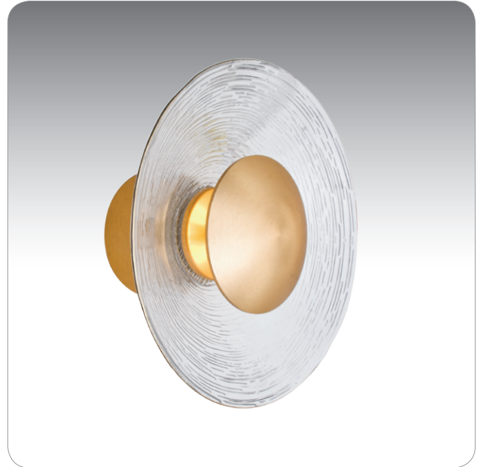
BRUSHED BRASS/CLEAR (SLYBB)