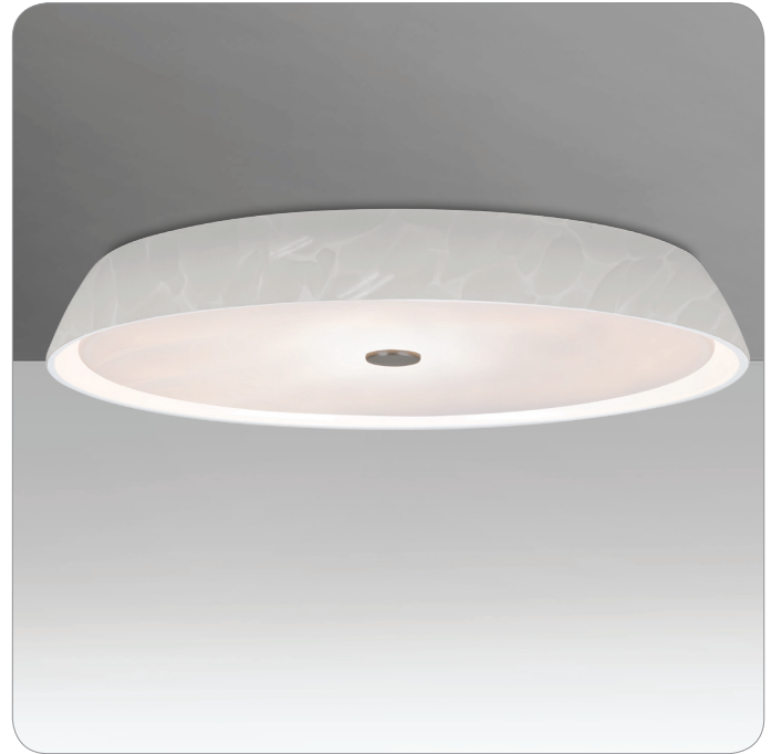
SOPHI SHOWN IN WHITE CLOUD

UL or ETL Listed. Suitable for Damp Locations (interior use only).