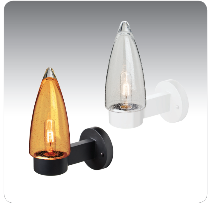
SULU SHOWN IN AMBER BUBBLE (SULUAM) & IN CLEAR BUBBLE (SULUCL)