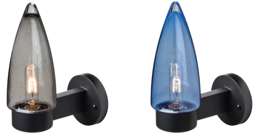
SULUBL BLUE BUBBLE

All dimensions provided are nominal. Allowance must be made for dimensional tolerance in handcrafted glasses.