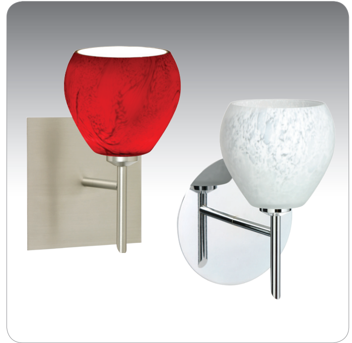
TAY TAY SHOWN IN MAGMA (5605MA) WITH SQUARE CANOPY & CARRERA (560519) IN CHROME FINISH