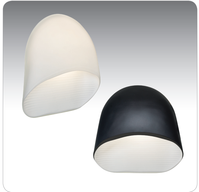
WHITE (TOROWH) & BLACK (TOROBK)

UL or ETL Listed. Suitable for Wet Locations (interior or exterior use).