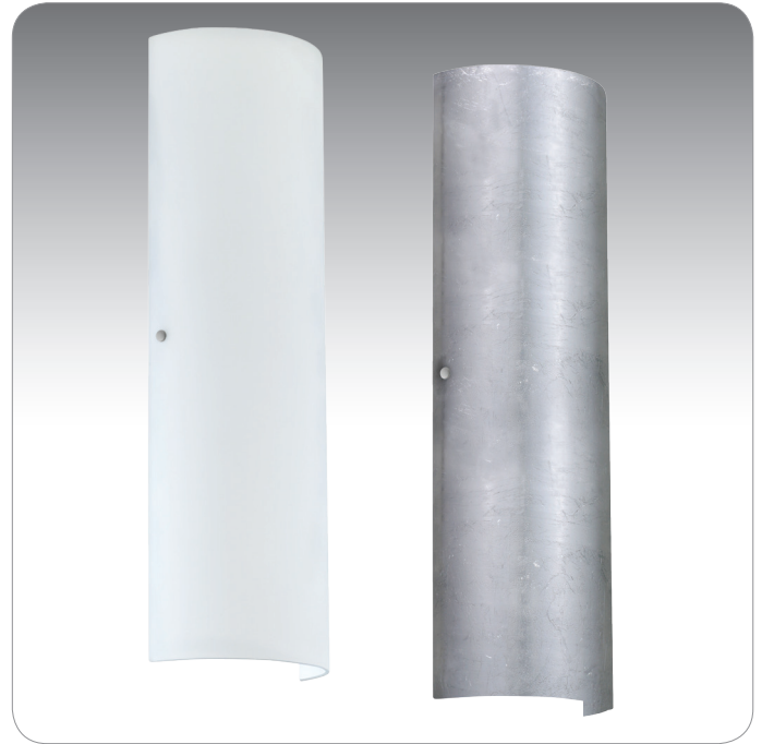
TORRE 22 SHOWN IN WHITE (819407) & SILVER FOIL (81945F)

UL or ETL Listed. Suitable for Damp Locations (interior use only).