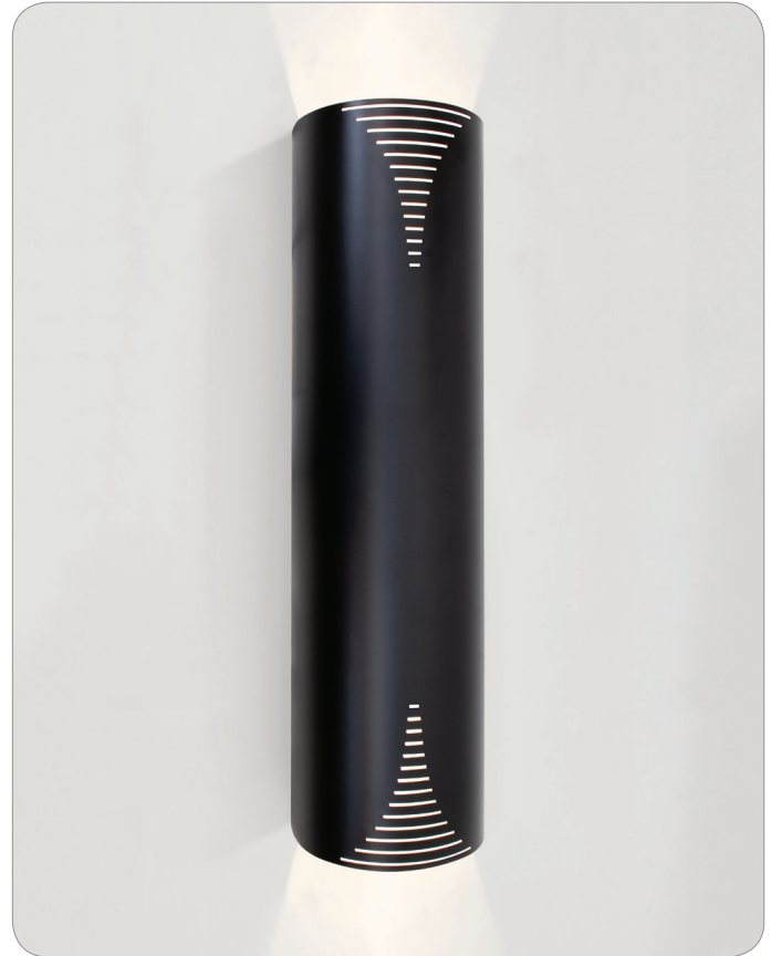
EDGE24-WH-LED-BK BLACK WITH WHITE DIFFUSER